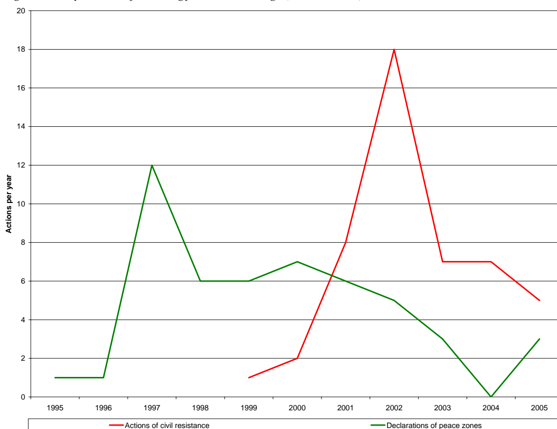
Figure 2: Dynamic of Strategy 5 – Resisting (1995-2005)